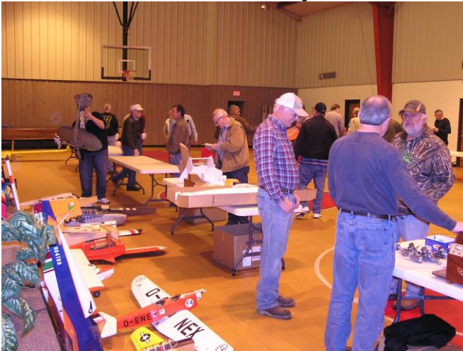
Just getting started

CCRCC's annual swap meet was well attended and full of many great buys. I found a few myself. Next year I will be better prepared, i.e. more money.