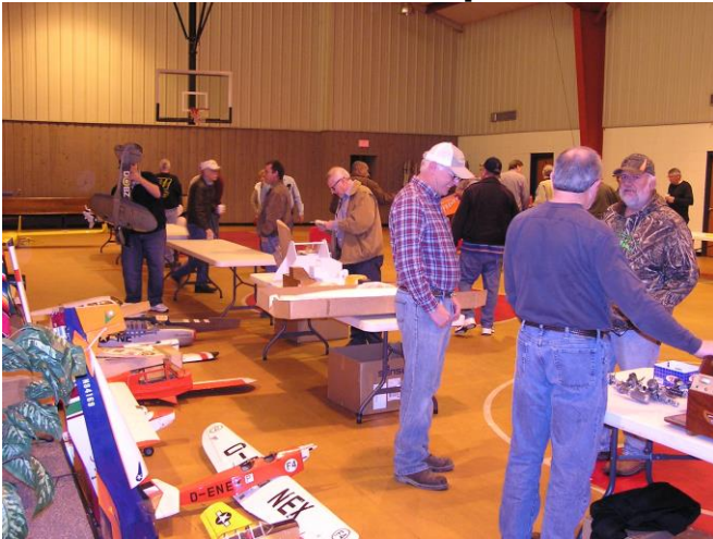
Just getting started

CCRCC's annual swap meet was well attended and full of many great buys. I found a few myself. Next year I will be better prepared, i.e. more money.