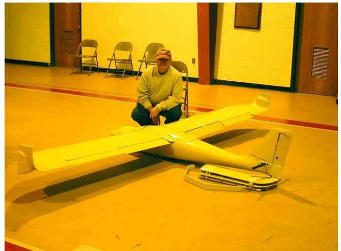
Research plane for those who like big machines