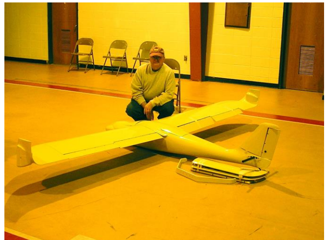
Research plane for those who like big machines