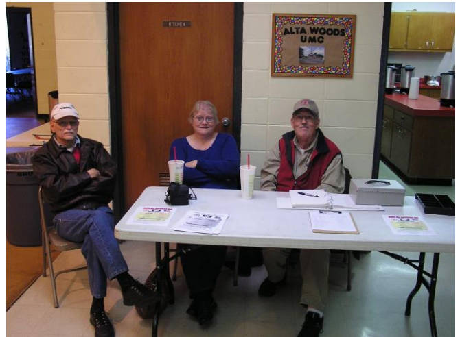
The money changers