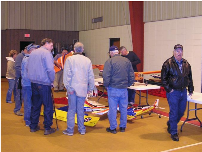
Something has captured their interest

Special thanks to the visitors from the surrounding clubs, they added a lots goodies to the tables.