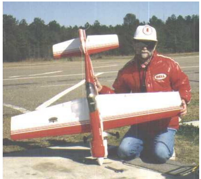
They never said that I had to learn to land.

Enter my first airplane kit--a Telemaster 40 with a Fox motor. Why I want you to know, as I was told these Telemasters are so easy to fly that they would fly by themselves and learning to fly one would be so easy that anyone could do it blindfolded.....So who believes that? (This does not include how easy Fox motors are to get to run properly.) Well, I did-- that is, until I got my hands on the transmitter for the first time and boy was I ever surprised. This is not easy I said to my instructor as I complained about the difficulty I was encountering. Well, as it turned out my plane was very tail heavy and every time I tried to make a turn it wanted to go into a spin. Also, along with a problem of the control rods had come loose inside the fuse and were giving me another control problem. But by this time quite a number of months had passed by and I still had not learned to fly or solo and was getting very frustrated but would not give up. I hate Telemasters to this day. After I got help from some very good people at CCRCC and got my plane doing what it was supposed to do I soon was able to solo. With this behind me I started to move up to sportier planes.