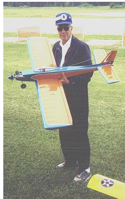
The Late Oscar Tissue