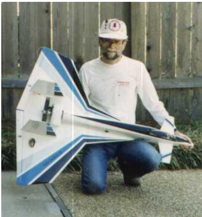
Poor Man's Jet

Flying is still fun to me but I always say that too much of a good thing is not good. One should always keep things in perspective no matter what you endeavor to do--in other words, if you do it too much, it loses its appeal. Use common sense in all that you do and don't let things get out of control.